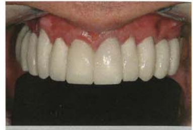
Figure 8 Free-hand sculpted temporaries.