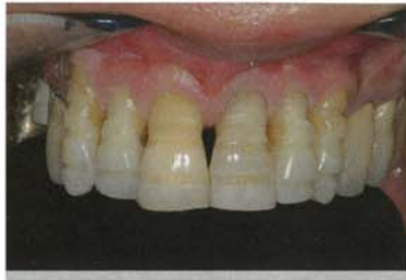
Figure 5 0.5-mm depth grooves were made for facial reduction.