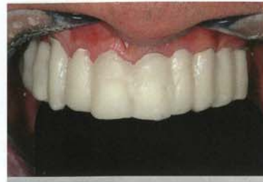
Figure 7 Temporaries in unsculpted form.