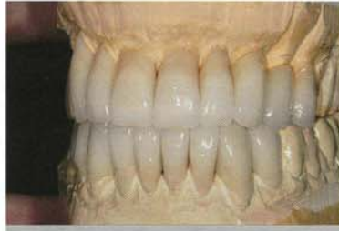
Figure 10 Ceramic restorations. Note the depth of color and root indications.