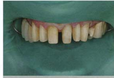
Figure 11 Rubber dam isolation for insertion of restorations.