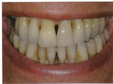
Figure 2 Preoperative smile view.