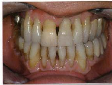
Figure 3 Preoperative retracted view. Note the stippling of the gingival tissue.