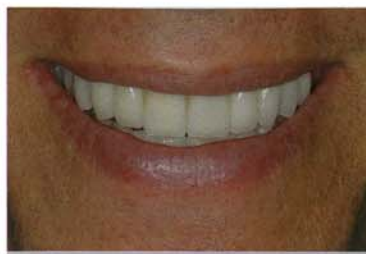
Figure 15 Smile view of the final result.