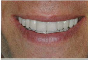
Figure 9 Smile view of the temporaries. Note the relaxed upper-lip position.