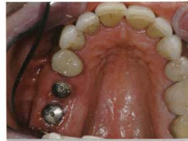
Figure 4 Preoperative occlusal view of the implants.