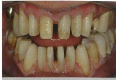
Figure 6 Completed upper and lower preparations. Note the open contacts to allow closure of black triangles.