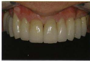
Figure 13 Final restorations, upper arch.