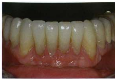
Figure 14 Final restorations, lower arch.