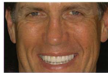
Figure 16 Full-face view of the final result.

very warm and natural. The patient was extremely happy with his final result and felt very confident with his appearance (Figure 15 and Figure 16).